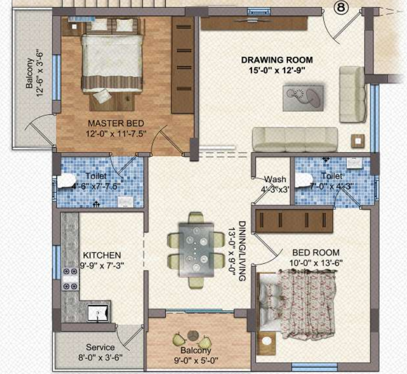
TYPICAL UNIT PLAN