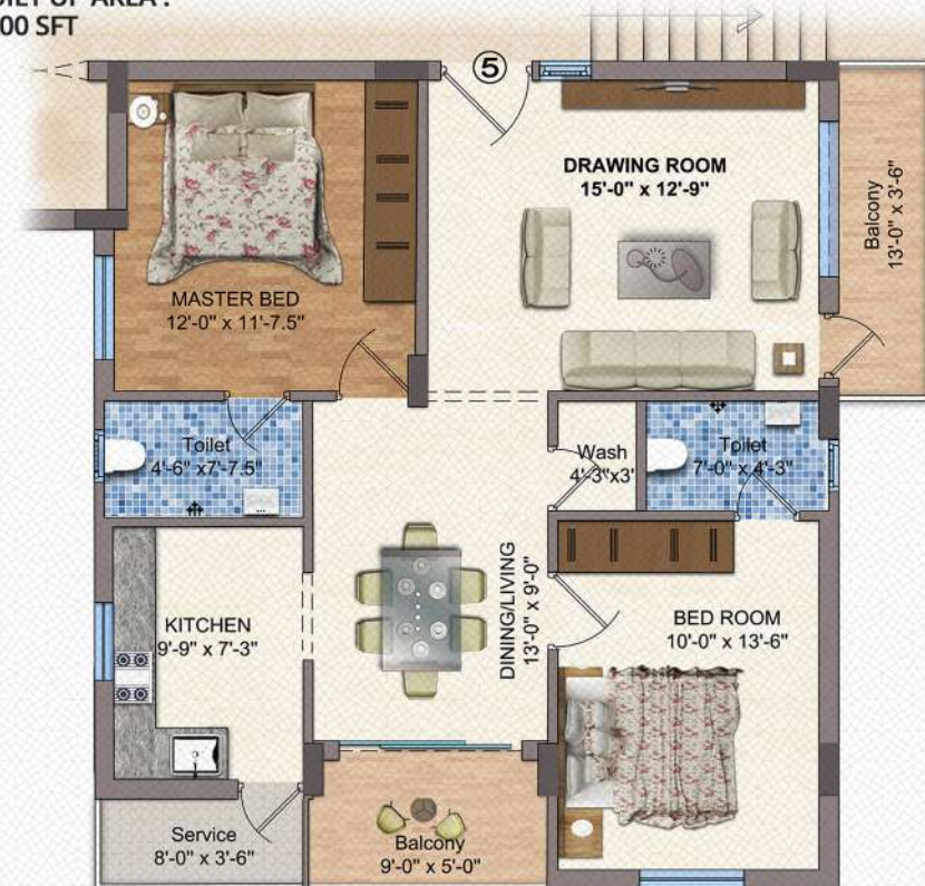
TYPICAL UNIT PLAN