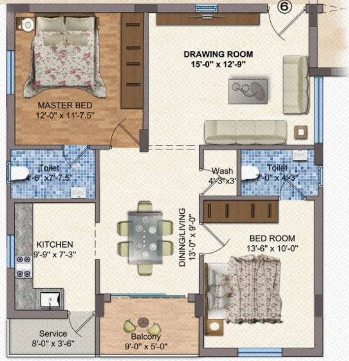
TYPICAL UNIT PLAN