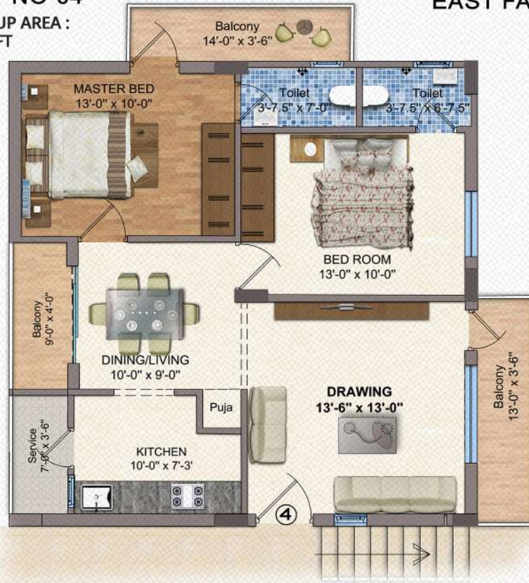
TYPICAL UNIT PLAN