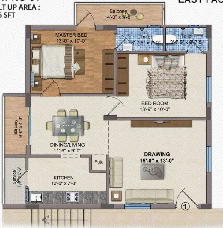
TYPICAL UNIT PLAN