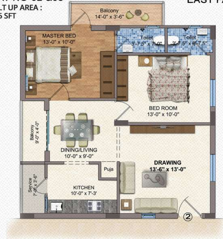
TYPICAL UNIT PLAN